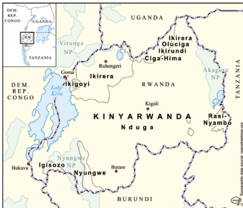
Map 2: Kinyarwanda dialects

The problems in reducing the many diverse Kinyarwanda varieties to one principal language, to be used throughout the colony, did not necessarily lie in the fact that missionaries “falsified” the language due to their own limited knowledge. Instead, their – at times very detailed – knowledge of the language and their advanced speaking skills led to ideologically subjective choices and decisions being made in matters of morphosyntax, lexicon etc. Often, their interventions knew no limitations, mainly due to the monopolisation of education and the privileged socioeconomic positions of individuals working for the church. In 1930, for instance, Léon Classe had convinced the colonial (Belgian) authorities to transfer the power over all colonial secondary schools to the missionaries. At times, missionaries were perceived as being extraordinarily competent in the language, leading to their decisions being easily accepted and often appearing irrevocable, as implied by Vansina: