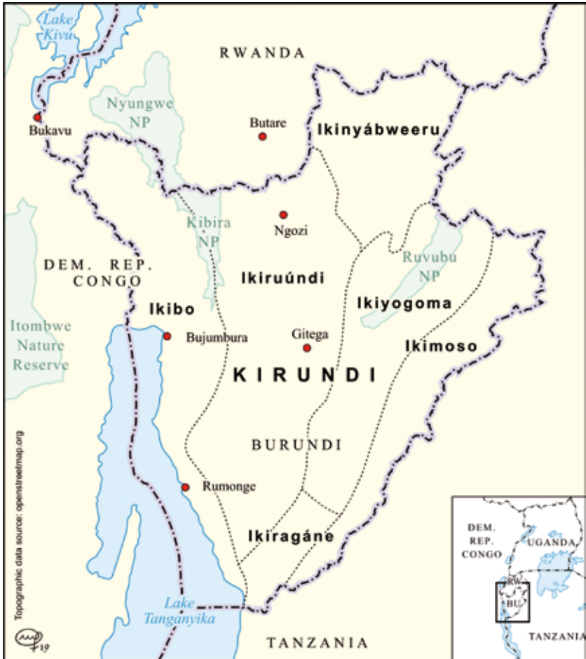
Map 3: Kirundi dialects (adapted from Bukuru 2003, Mayugi and Ndayishinguje 1985)

is currently used in all official domains, such as schools, churches, administration, and politics,” yet he underlines that, despite its status as the official language, it has not yet been fully standardised.