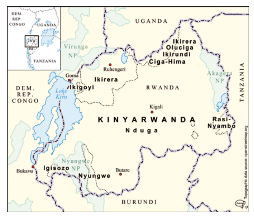
Map 2: Kinyarwanda dialects

The problems in reducing the many diverse Kinyarwanda varieties to one principal language, to be used throughout the colony, did not necessarily lie in the fact that missionaries "falsified" the language due to their own limited knowledge. Instead, their – at times very detailed – knowledge of the language and their advanced speaking skills led to ideologically subjective choices and decisions being made in matters of morphosyntax, lexicon etc. Often, their interventions knew no limitations, mainly due to the monopolisation of education and the privileged socioeconomic positions of individuals working for the church. In 1930, for instance, Léon Classe had convinced the colonial (Belgian) authorities to transfer the power over all colonial secondary schools to the missionaries. At times, missionaries were perceived as being extraordinarily competent in the language, leading to their decisions being easily accepted and often appearing irrevocable, as implied by Vansina: